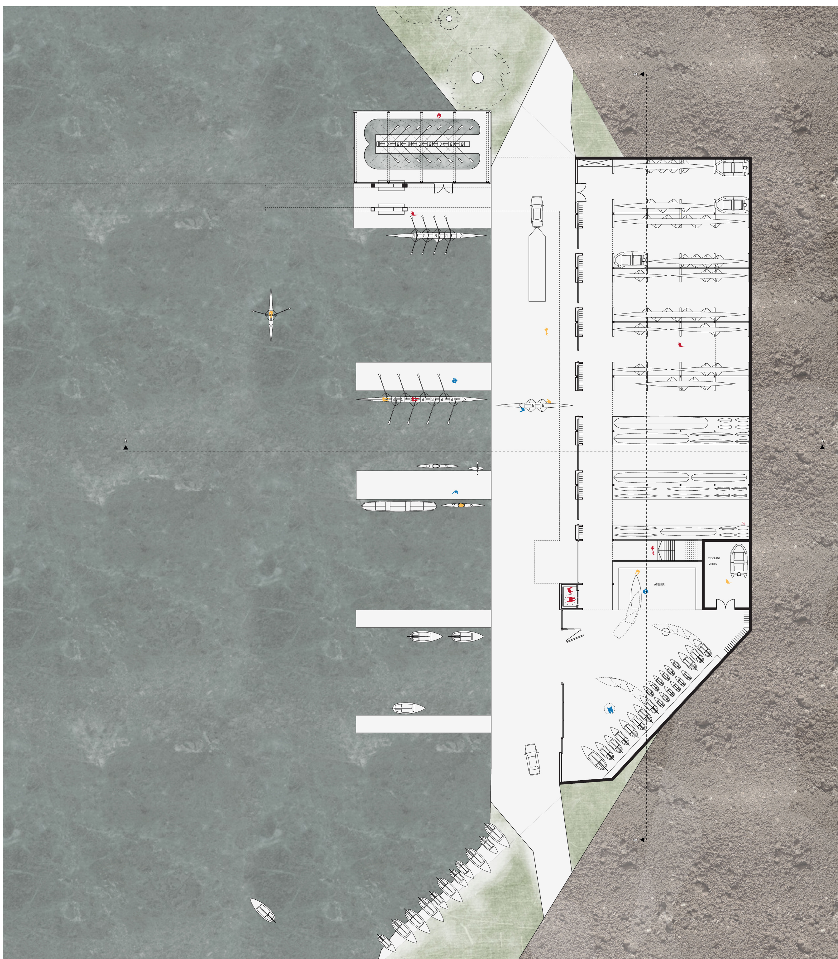
PLAN REZ-DE-BASSIN NIVEAU -3 1/200