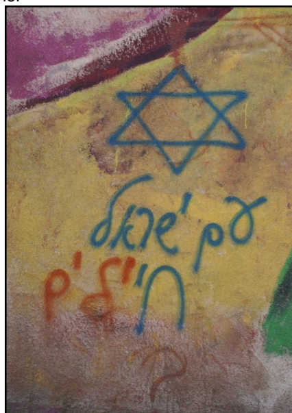
Fig.5 - Double graffiti and play on the words: “am Israel hai” – “am israel haialim” - “the people of Israel is alive” – “Israel is a people of soldiers” – Florentin 2008.

It is one of my arguments that Florentin offers a great arena for capturing the processes taking place nowadays in the Israeli society through a detailed observation and analysis of gentrification, migration, urban activism and of the production of urban identities. The picture reproduced above (Fig. 4) summarizes most of what has been just said and it is one example of a graffiti you can find on many walls of Florentin. Working on globalization, no doubt it is a detail but I suggest taking it as an informative one. It reads “Am Florentin hai”: “the people of Florentin lives” and is written in green and decorated with a