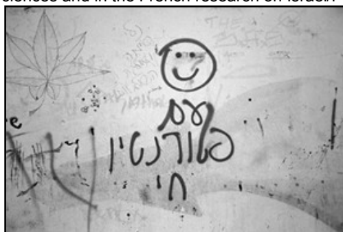
Fig. 4 - Graffiti “Am Florentin hai” - “the people of Florentin lives” Florentin 2008

It is one of my arguments that Florentin offers a great arena for capturing the processes taking place nowadays in the Israeli society through a detailed observation and analysis of gentrification, migration, urban activism and of the production of urban identities. The picture reproduced above (Fig. 4) summarizes most of what has been just said and it is one example of a graffiti you can find on many walls of Florentin. Working on globalization, no doubt it is a detail but I suggest taking it as an informative one. It reads “Am Florentin hai”: “the people of Florentin lives” and is written in green and decorated with a