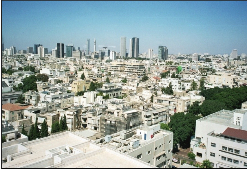
Fig. 1- Tel Aviv in 2008 with the business quarter and its high-rises in the background and the trees of Rotschild Boulevard on the right side of the picture

complex ensembles cities constitute today and it is a key to understand the constitution of the urban and social fabrics; how it is created and sometimes unraveled.